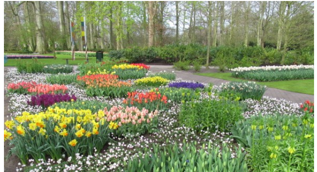
Keukenhof Gardens last year. Maybe next year...

One difficulty for us is deciding at which point to cancel a tour. We don't want to do it too early if there is a